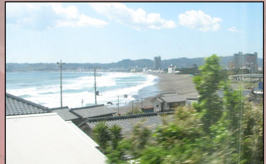
View from the train