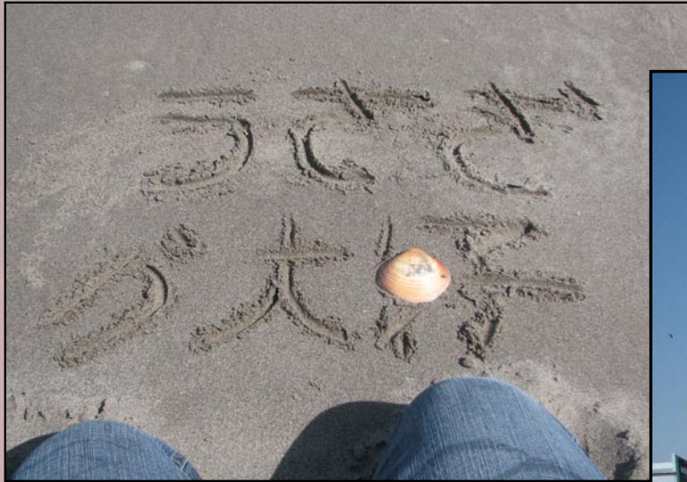
„Crazy things to do in Kamogawa“, Part I