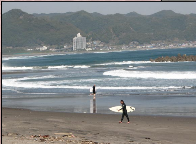
A surfer's paradise (and more!)