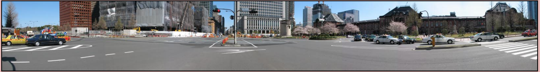
To the Imperial Palace