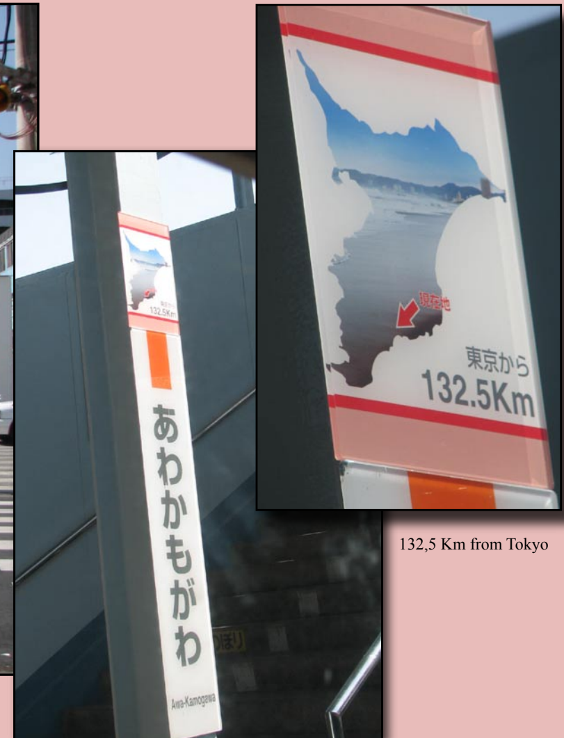
132,5 Km from Tokyo