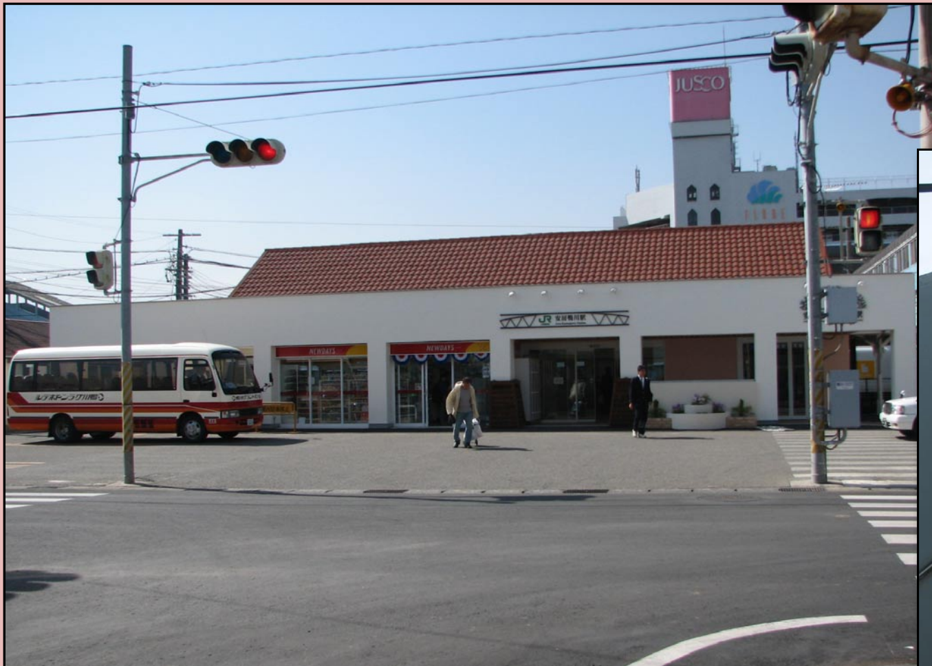
Point of Destination: Awa Kamogawa station